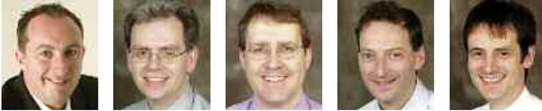
Staff from the School of Dentistry